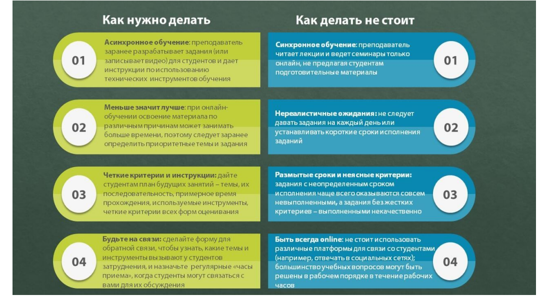
Figure 2. Site of the National Research University Higher School of Economics. Instructor Memo<sup>3</sup>

On the website of another leading Russian university, the National Research University Higher School of Economics, a separate page was created in 2020 with recommendations for the transition of education to a digital environment during a pandemic, which contains instructions for teachers and students. They gave recommendations on organizing classes and communicating with students in various formats<sup>2</sup>, including a step-by-step "Memo on how to transfer classes to online type"<sup>3</sup>. Among the recommendations, one should especially highlight those that contain advice "How to do" and "How not to do" for the effective organization of online learning. As a reduction in the risks of a cognitive nature, we noted recommendations aimed at maintaining students' motivation to learn, as well as reducing the unnecessary burden on the student to maintain the quality of education.