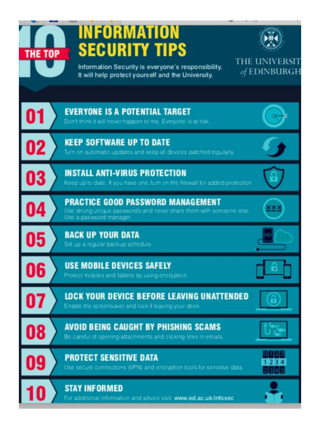
Figure 1. Website of the University of Edinburgh. Top 10 rules for information security

the organization of their online education in 2020<sup>1</sup>. At the same time, issues of cybersecurity and cybersecurity were not reflected separately on the site.